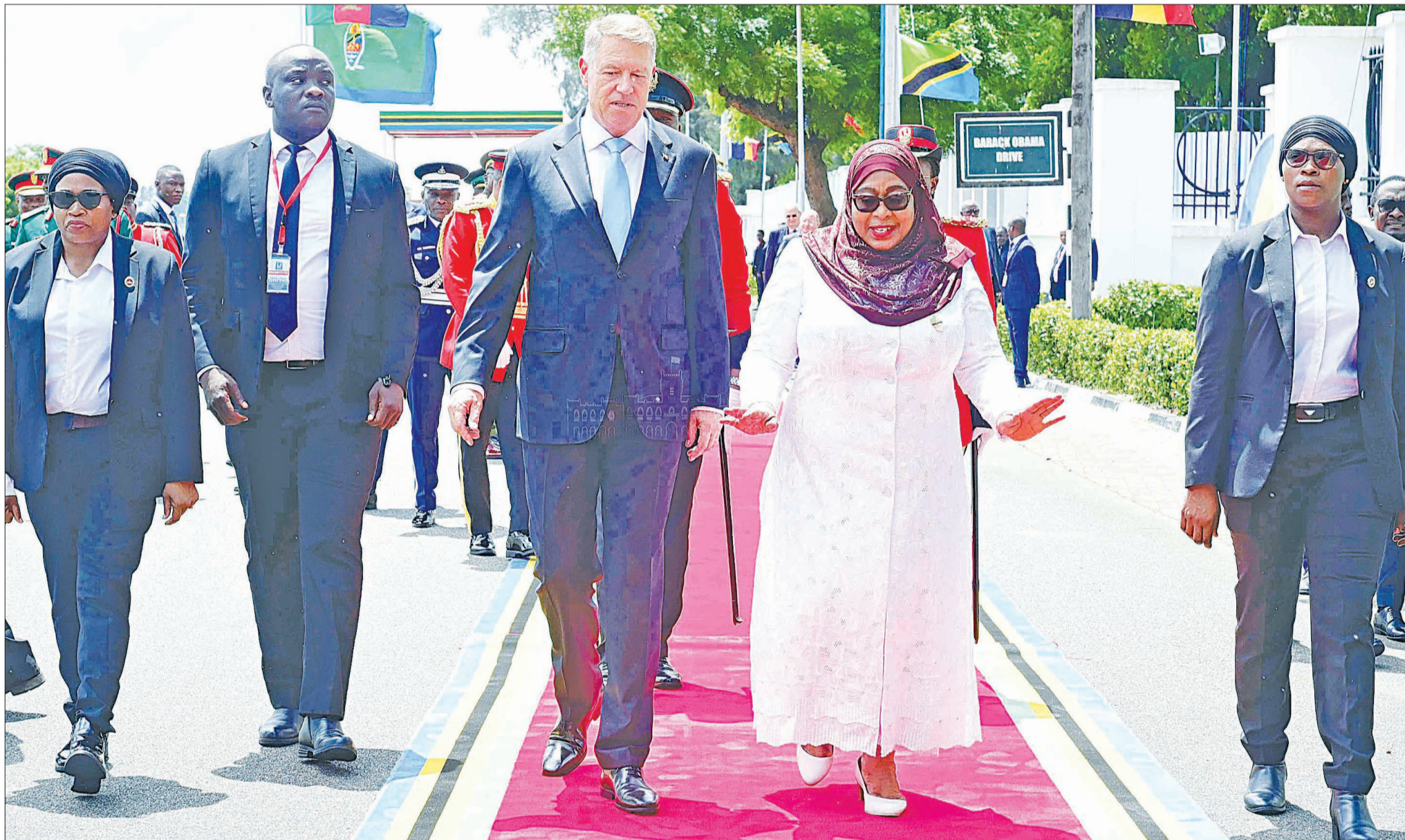
PRESIDENT Samia Sulu Hassan in conversation with her guest, Romanian counterpart, Klaus Werner Iohannis as he leaves the State House in Dar es Salaam, yesterday, after a four-day state visit in the country.